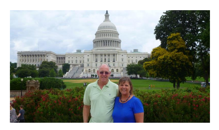
40 years on